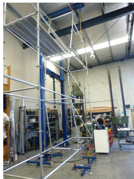
FIG.3 SCAFFOLD UNDER PEAK LOAD