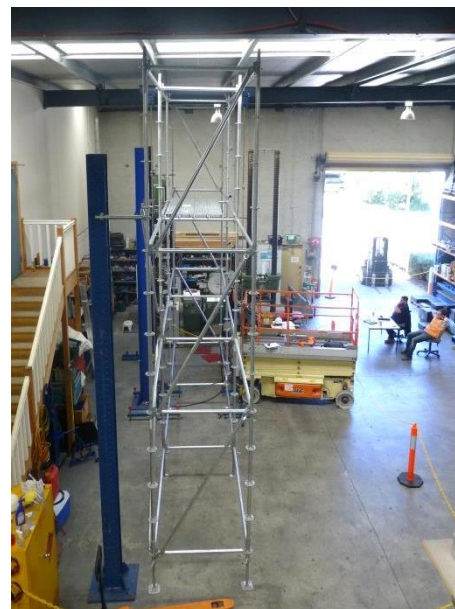
FIG.2 SCAFFOLD UNDER TEST