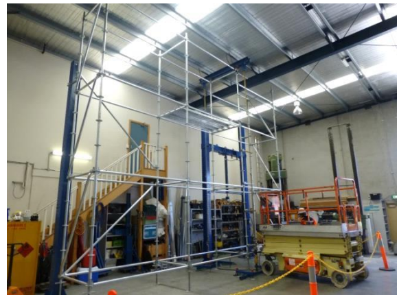
FIG.1 CORONET RINGLOCK SCAFFOLD TEST ASSEMBLY

Prior to erecting the test scaffold, the mass and dimensional attributes of each scaffolding component were measured and recorded for the determination of the assembled scaffold gravity dead loads ( G_d ). All measurements were conducted using calibrated MTS measuring devices and are provided in Appendix A of this report. MTS wishes to advise the reader that, as per the design of the CORONET Ringlock scaffold system, the ledger and transom components are interchangeable units and share similar dimensional attributes.